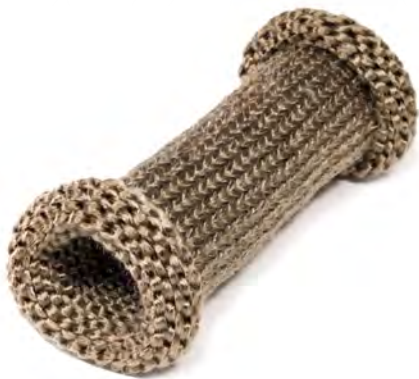
KNITTED BASALT SLEEVE

This extreme temperature Basalt knitted sleeve provides excellent thermal protection and will withstand continuous exposure to temperatures of up to 1400°F (750°C). Typical applications include automotive, heavy-duty truck and bus exhaust tubes and pipes, and high temperature industrial applications. When installed on vehicle exhaust tubes and pipes, our Basalt sleeve facilitates an increase in the efficiency of a vehicle's emission control system through the retention of high temperatures as gases flow through the exhaust system. Moreover, the sleeves reduce radiation of heat to adjacent components to preserve the integrity of these components.